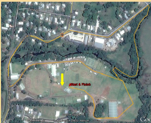
YIB 3k Run & 3km Walk & Registration.